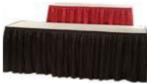
Table Skirt Color: _____ blue _____ red _____ burgundy _____ black _____ green _____ yellow _____ white

(Standard table height is 30in. Add $40 for 40in high skirted table.) (All sizes skirted on three sides. For skirt on 4th side, add $20 on 30in tall table, $30 on 40in tall table)